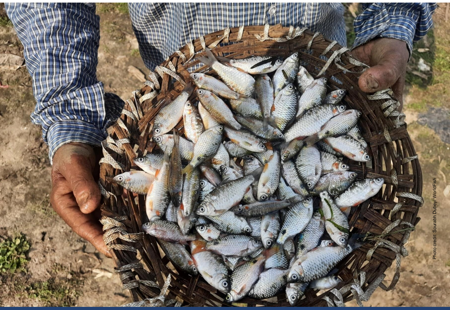
Various Puntius spp. caught from Beel in Assam